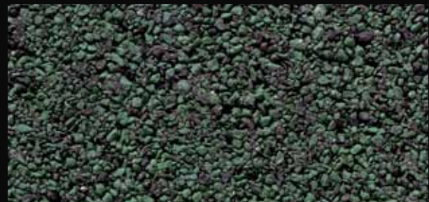
EMPIRE GREEN BLEND ●

Elite Glass-Seal® available in colors marked with a ● Glass-Seal available in colors marked with a ◆