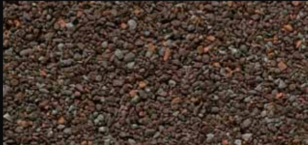
RUSTIC SLATE ●