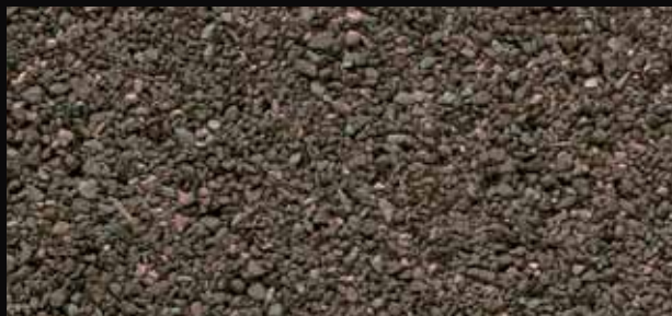
WEATHERED WOOD ●◆