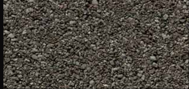
OXFORD GREY ●