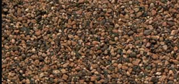
RUSTIC CEDAR ●◆