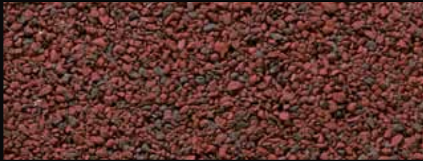
TILE RED BLEND ●