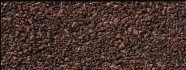
RUSTIC REDWOOD ◆