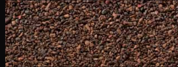
TWEED BLEND ◆