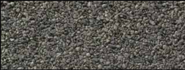
ANTIQUÉ SLATE ◆