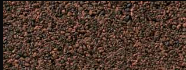
RUSTIC HICKORY ●◆