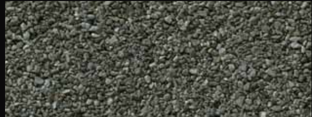
OXFORD GREY ●