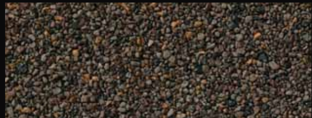
RUSTIC SLATE ●

NOTE: TAMKO® RECOMMENDS VIEWING AN ACTUAL ROOF INSTALLATION OR SEVERAL FULL-SIZE SHINGLES PRIOR TO FINAL COLOR SELECTION FOR THE FULL IMPACT OF COLOR BLENDING AND PATTERNS. REPRODUCTION OF THESE COLORS IS AS ACCURATE AS OUR PRINTING WILL PERMIT. Due to demand, certain products and colors may not be available in your area. Contact your local TAMKO representative for more information.