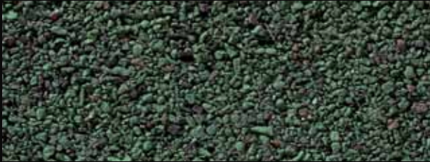
EMPIRE GREEN BLEND ●