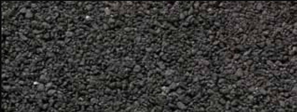
RUSTIC BLACK ●◆