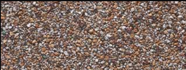
DESERT SAND ●