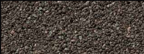
WEATHERED WOOD ●◆