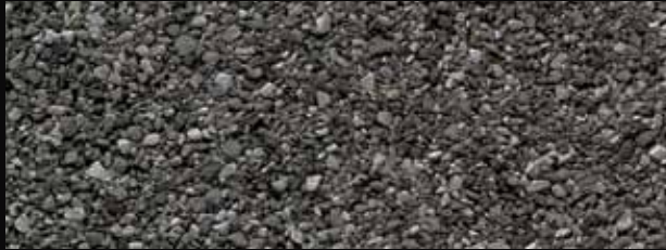
SHADOW GREY ●