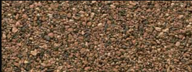
RUSTIC CEDAR ●◆