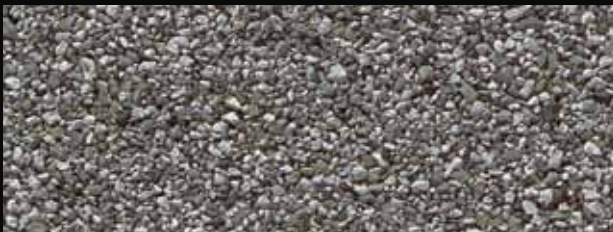
GREY BLEND ●