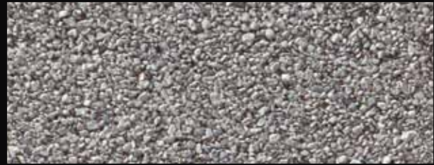
GLACIER WHITE ●◆