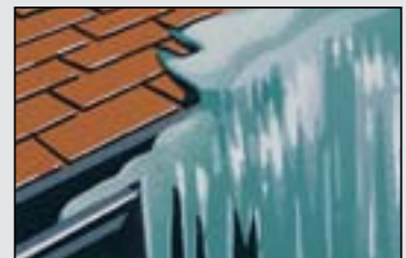
Backed up at the eaves by ice dams, melting snow finds access the same way.