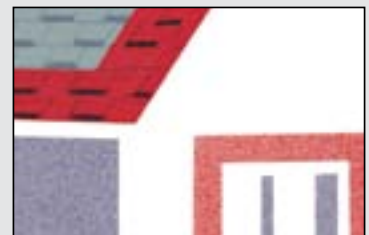
Applying a layer of Moisture Guard Plus to the deck at all rake and eave edges a minimum of 24" beyond the interior wall line will provide a last line of defense against leaks, to help prevent backed-up water from getting into the home.