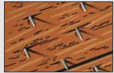
Nail holes and joints in your roof deck provide the channels for water to seep through.