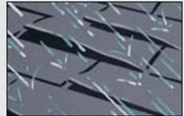
Wind-blown rain trapped under your roof's top layer seeks out those channels.