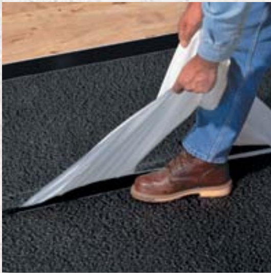
TW Metal and Tile Underlayment