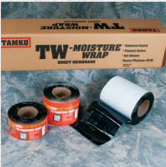
TW Moisture Wrap