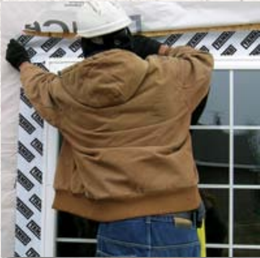
TW Window & Door Flash