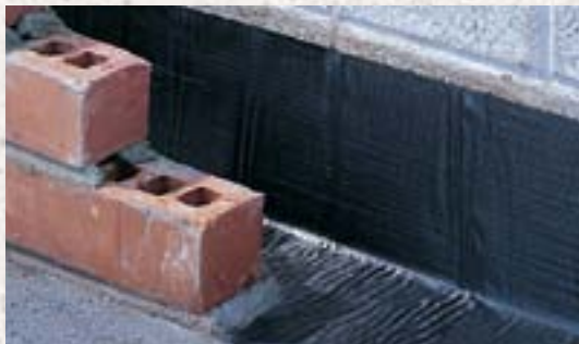
TW-Thru Wall Flashing Membrane

A 40-mil-thick self-adhering rubberized asphalt sheet membrane, TW Flash-N-Wrap®-40 features a tough reflective aluminum surface that resists UV degradation for up to 180 days and has a removable treated release film on the adhesive side. It is well suited for cavity wall construction as a moisture and air barrier membrane and is available in a variety of factory precut rolls of 9-, 12- and 36-inch widths. Self-adheres to cast-in-place concrete, precast concrete, concrete masonry block, exterior gypsum sheathing, plywood, oriented strand board (OSB), DensGlass®, DensGlass Gold®, felt-faced and foil-faced polyisocyanurate foam insulation and wood or metal surfaces.