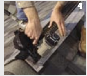
Create end cap by folding fabric in toward center at each side; then up and over nylon matrix so that it covers the end of the vent. Center Rapid Ridge over slot at one end with nail lines up and fasten with 1¾" collated nails provided. (Note: minimum nail length is 1¼".) Recommended nail gun compressor pressure is between 90 and 100 psi.