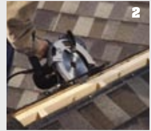
Snap chalk line and cut a slot 3" wide (1½" on each side of ridge beam). Allow for a closed area of sheathing (with no slot) approximately 18" at both ends of ridge.