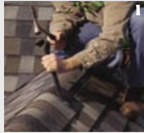
Remove ridge cap shingles along the entire length of roof.