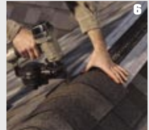
Install ridge cap shingles with even spacing on both sides of Rapid Ridge using 1¾" collated nails provided. Nail approximately 2½" in from cap shingle edge on nailing line. Nails should penetrate the sheathing a minimum of ¾". Ridge cap must overhang Rapid Ridge by a 1" minimum at each gable end.