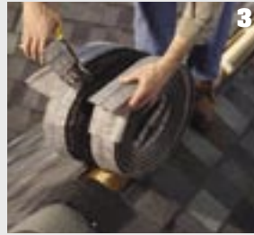
Loosen about 6" of nylon matrix from fabric and cut out with snips.