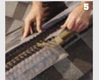
To splice, remove nylon matrix (3") as shown in photo #3 and fit together by overlapping remaining fabric with next section and fasten to roof deck.