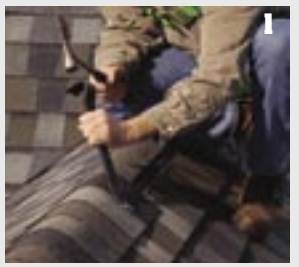
Remove ridge cap shingles along the entire length of roof.