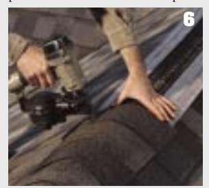
Install ridge cap shingles with even spacing on both sides of Rapid Ridge using 1½" collated nails provided. Nail approximately 2½" in from cap shingle edge on nailing line. Nails should penetrate the sheathing a minimum of ½". Ridge cap must overhang Rapid Ridge by a 1." overhang Rapid Ridge by a 1 minimum at each gable end.