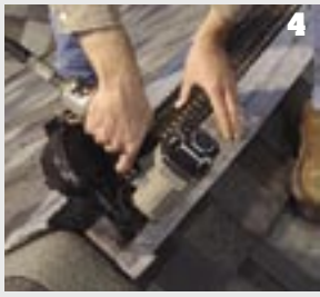
Create end cap by folding fabric in toward center at each side; then up and over nylon matrix so that it covers the end of the vent. Center Rapid Ridge over slot at one end with nail lines up and fasten with 1\frac{3}{4} " collated nails provided. (Note: minimum nail length is 1\frac{3}{4} ".) Recommended nail gun compressor pressure is between 90 and 100 psi.