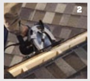
Snap chalk line and cut a slot 3" wide (1½" on each side of ridge beam). Allow for a closed area of sheathing (with no slot) approximately 18" at both ends