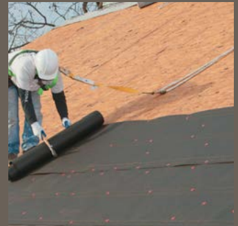
Felts and Other Underlayments