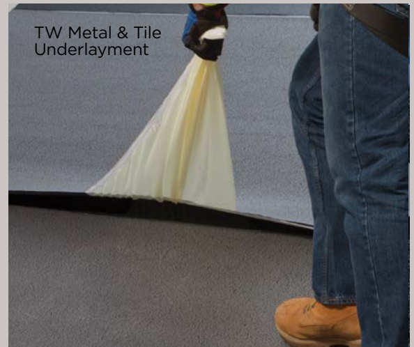
TW Metal & Tile Underlayment

IMPORTANT: Follow all proper fall protection procedures in accordance with OSHA regulatory requirements—including the use of personal fall protection devices when working on a roof. Applicator safety is of utmost importance.