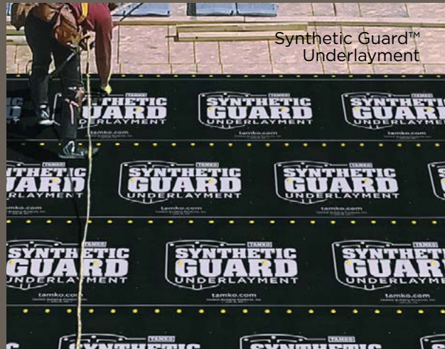
Synthetic Guard™ Underlayment