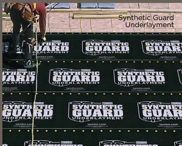
Synthetic Guard Underlayment