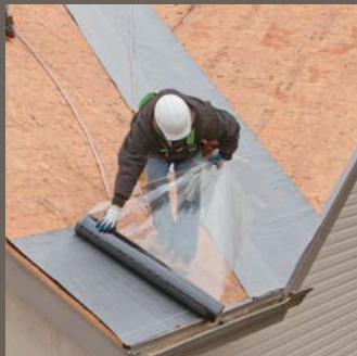
Film Surfaced Self-Adhering Underlayments