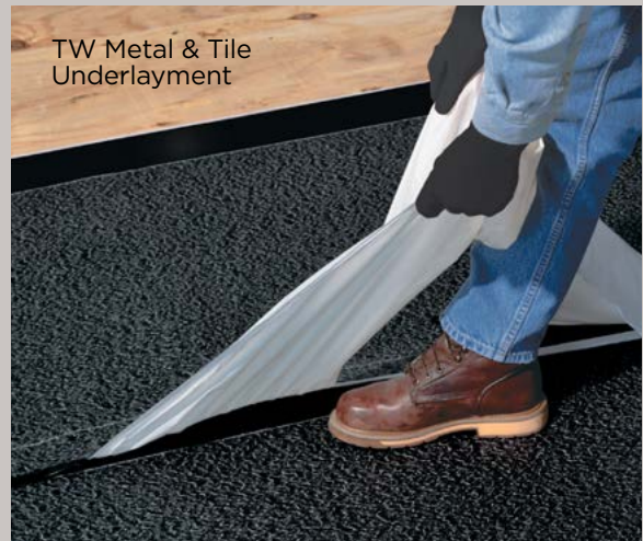
TW Metal & Tile Underlayment

IMPORTANT: Follow all proper fall protection procedures in accordance with OSHA regulatory requirements—including the use of personal fall protection devices when working on a roof. Applicator safety is of utmost importance.