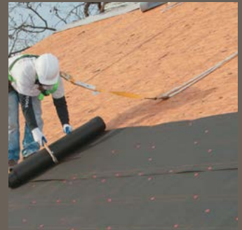
Felts and Other Underlayments