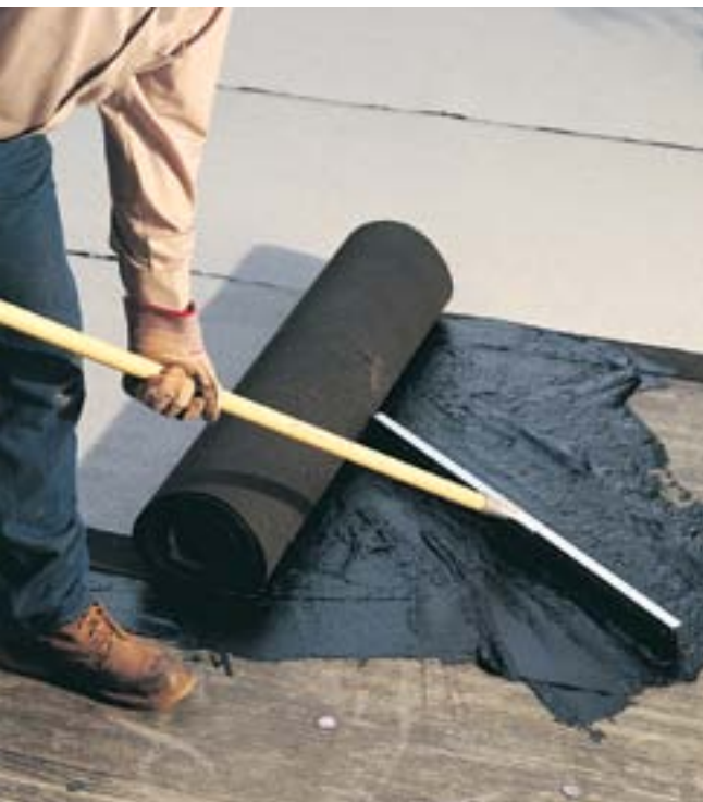
TAM-PRO Premium SBS Adhesive squeegee applied. TAM-PRO M3 Adhesive spray or squeegee applied.

Strong, high-tensile, multidirectional resistance to punctures, thermal shock and tearing.