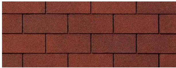
TILE RED BLEND