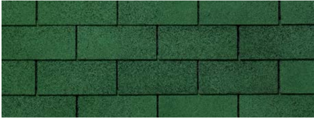
EMPIRE GREEN BLEND