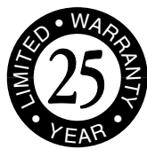
Elite Glass-Seal ®

RETAIN THIS LIMITED WARRANTY AND YOUR CONTRACTOR'S RECEIPT(S) FOR FUTURE REFERENCE