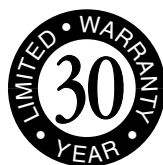
Heritage Woodgate® Heritage®